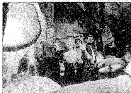
In the 1959 film based on Verne's novel, a group of adventurers discovers a strange world at Earth's core, complete with dinosaurs, lakes, and even a sun.